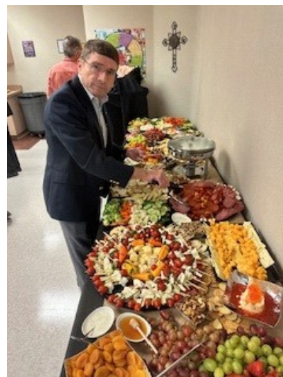
Dinner from Monzu Italian Restaurant